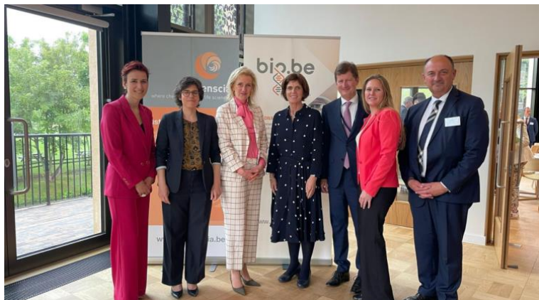
Belgian Economic Mission to the UK – May 2022