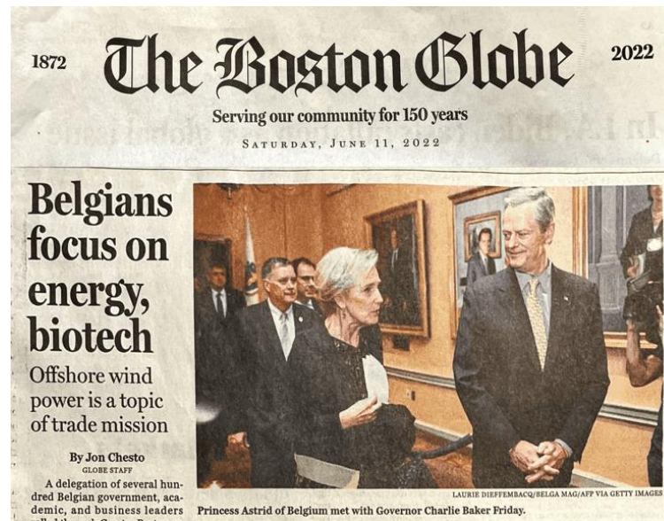
Belgian Economic Mission to the USA – June 2022