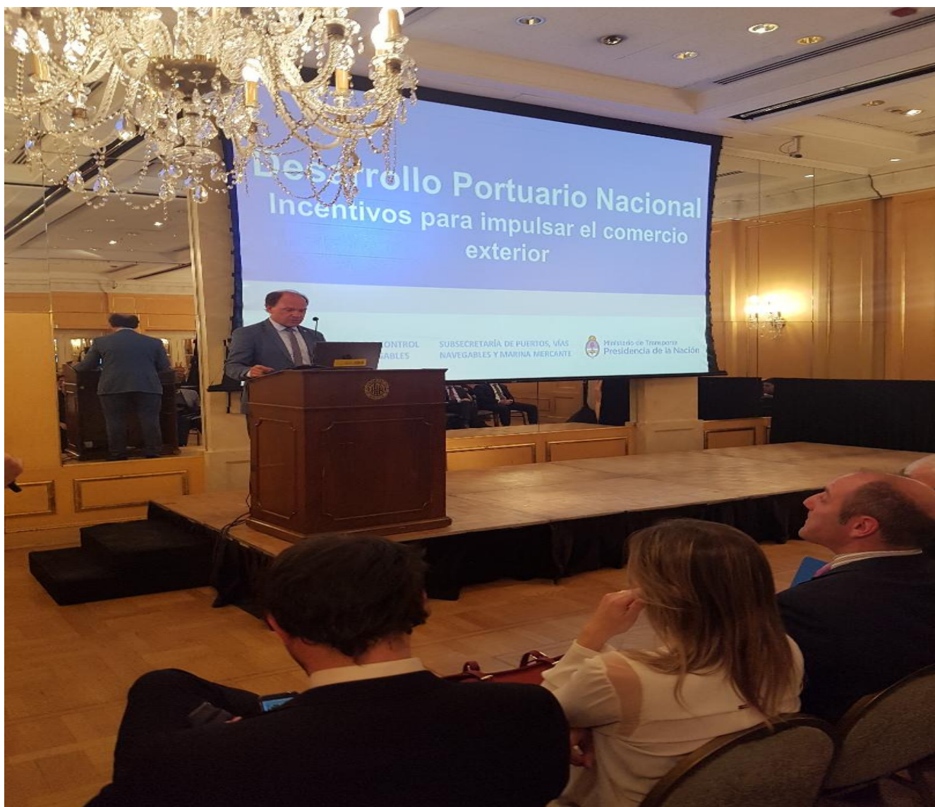
Speech by Official opening of the seminar H.E. Philippe Muyters, Minister for Work, Economy, Innovation and Sport of the Government of Flanders